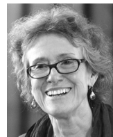
Arlie R. Hochschild Professor Emerita of Sociology, Writer