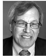
Erwin Chemerinsky Berkeley Law Dean, Constitutional Law Scholar, and Founding Dean of UC Irvine School of Law