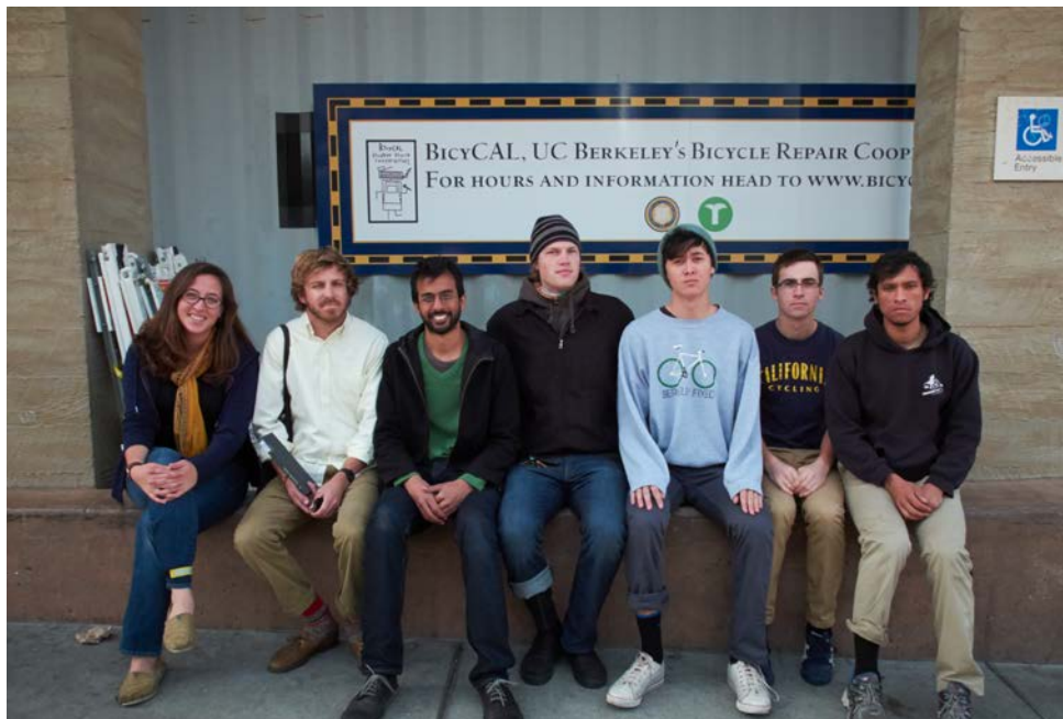
Figure 1: Bicycal members outside our work space, temporarily housed in a shipping container on the steps of MLK student union just off Upper Sproul. BicyCal will have a permanent storefront in redeveloped Lower Sproul when it is completed.

What we do: Our primary service is opening up our facility to the public several times per week for "open shop". During these hours, anyone can borrow tools and receive guidance for virtually any bicycle repair. Activities range from simply patching flats to overhauling hubs to assembling bicycles out of the box. BicyCal's volunteer mechanics guide customers through their repairs while making it a point to keep the wrenches in customers' hands; this ensures not only a learning experience for the customer, but also the empowerment that comes from understanding how a bike works and how one can fix it.