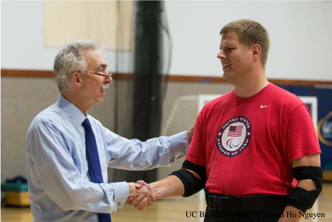
UC Berkeley