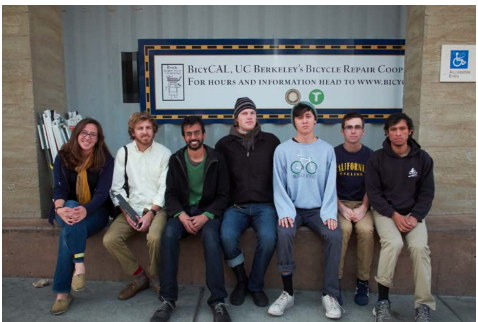
Figure 1: Bicycal members outside our work space, temporarily housed in a shipping container on the steps of MLK student union just off Upper Sproul. BicyCal will have a permanent storefront in redeveloped Lower Sproul when it is completed.

What we do: Our primary service is opening up our facility to the public several times per week for "open shop". During these hours, anyone can borrow tools and receive guidance for virtually any bicycle repair. Activities range from simply patching flats to overhauling hubs to assembling bicycles out of the box. BicyCal's volunteer mechanics guide customers through their repairs while making it a point to keep the wrenches in customers' hands; this ensures not only a learning experience for the customer, but also the empowerment that comes from understanding how a bike works and how one can fix it.